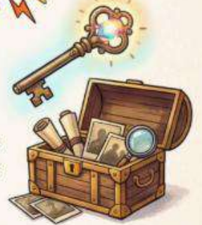
Digital Heritage Archives