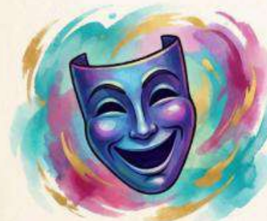
Role Play and Simulations